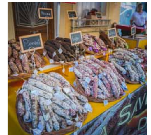
Left: Market tours are now part of the cookery school's offering