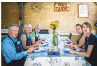
Eating the fruits of their labour!

It is generally agreed that you’ll need at least three gîtes to make it viable to rely solely on them for your main source of income. You’ll also need to consider the additional facilities you’ll need to offer your guests, and ways to make money from your gîtes in off-peak seasons.